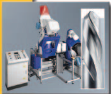
Edge Prep™ - A DCT specialty area.